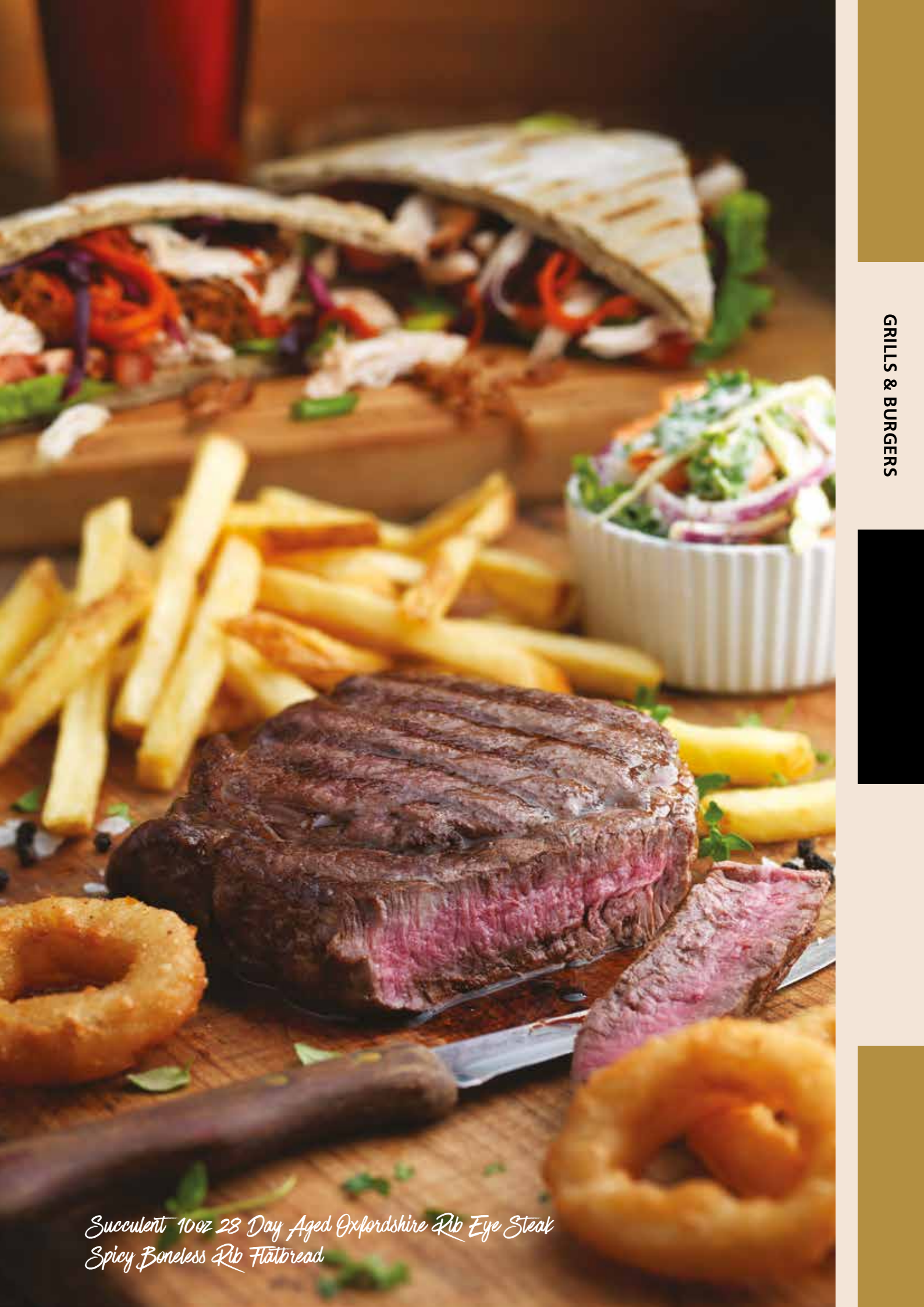
Succulent 10oz 28 Day Aged Oxfordshire Rib Eye Steak Spicy Boneless Rib Flatbread