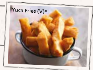
Yuca Fries (V)*

Unless stated, the fish we serve on our menu is either cod or haddock depending on the availability because we only select fish from sustainable sources. Please ask when ordering today's fish. Our scampi is made from tails of Langoustine caught in UK waters.