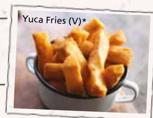
Yuca Fries (V)*