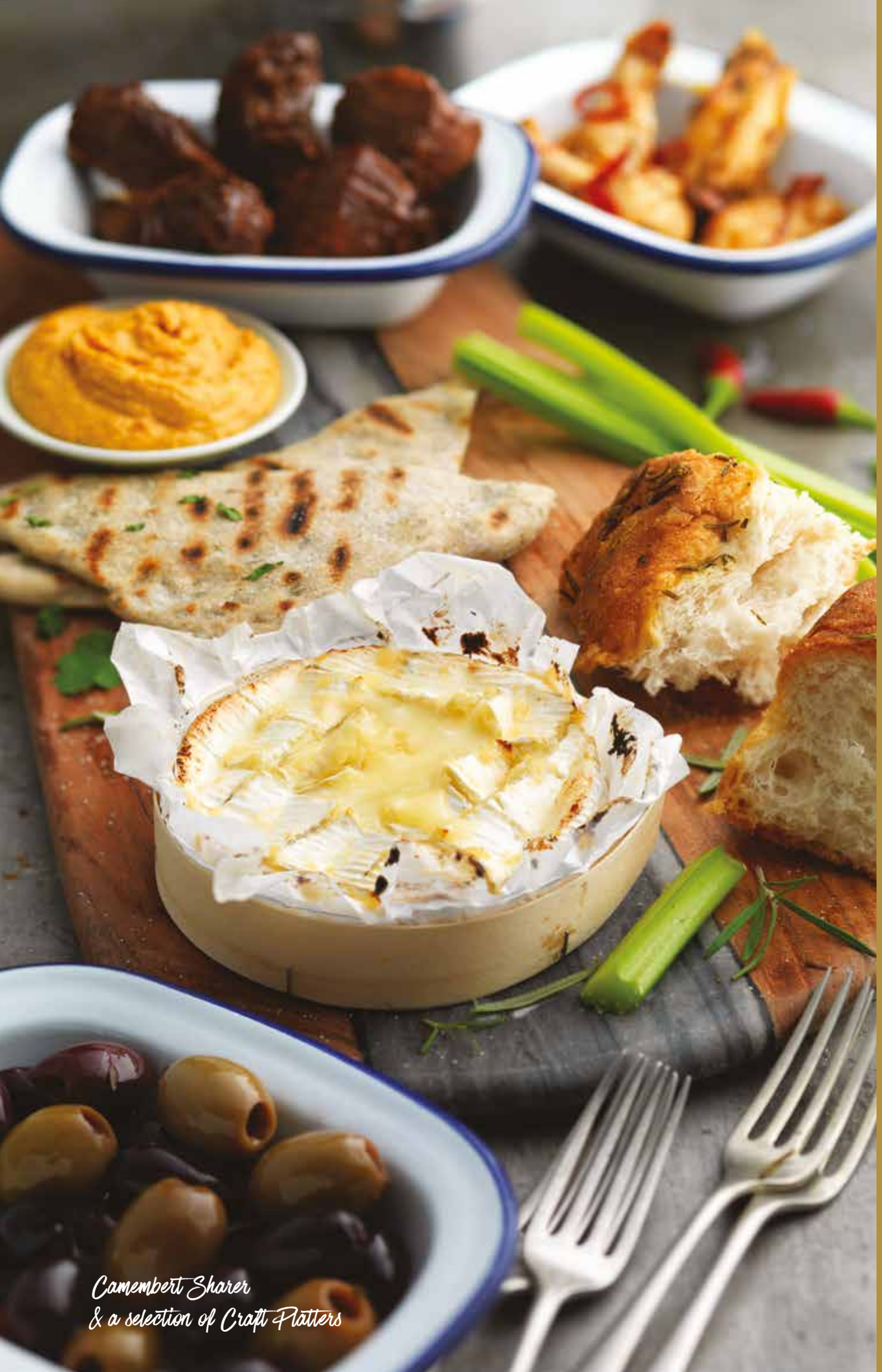
Camembert Sharer & a selection of Craft Platters