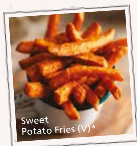
Sweet Potato Fries (V)*

Grilled & topped with a free-range fried egg & a pineapple ring. With skin-on fries & garden peas.