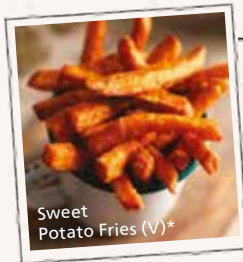
Sweet Potato Fries (V)*