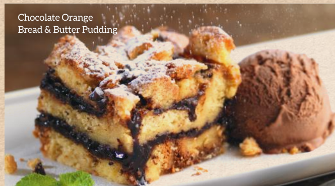
Chocolate Orange Bread & Butter Pudding

under 600 Cal Chocolate Orange Bread & Butter Pudding V £4.25 Layers of bread and rich chocolate baked with an orange and vanilla egg custard. Served warm with Beechdean™ Belgian chocolate truffle ice cream.