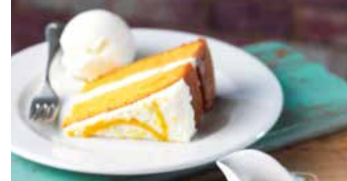
Peach Melba Cake