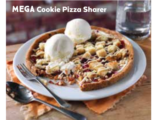
MEGA Cookie Pizza Sharer

9" chewy choc chip cookie, layered with smooth and creamy white chocolate custard and fruity raspberry sponge. Topped with moist chunks of buttermilk sponge, crushed raspberries, shortcake chunks and swirls of white chocolate, served with vanilla flavour ice cream.