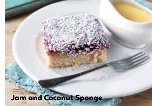
Jam and Coconut Sponge