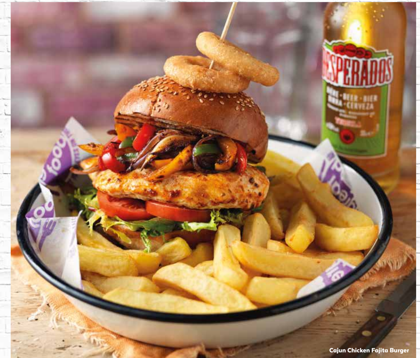
Cajun Chicken Fajita Burger