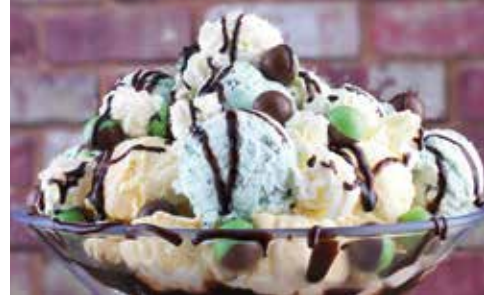
MEGA Minty Sundae

Go big or go home! A sharer size serving of the single sundae.