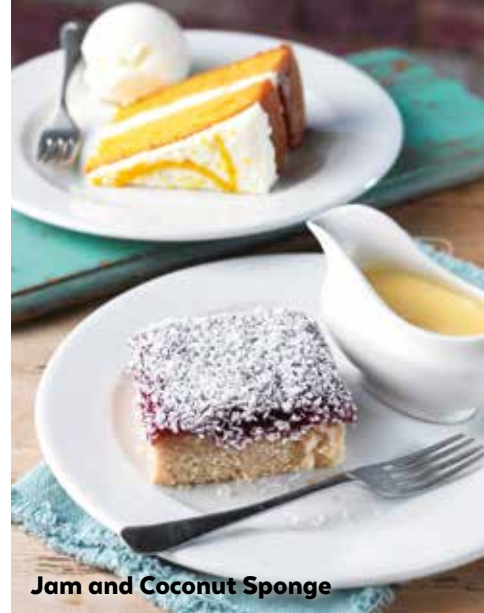
Jam and Coconut Sponge