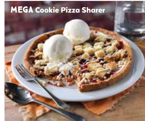
MEGA Cookie Pizza Sharer

9" chewy choc chip cookie, layered with smooth and creamy white chocolate custard and fruity raspberry sponge. Topped with moist chunks of buttermilk sponge, crushed raspberries, shortcake chunks and swirls of white chocolate, served with vanilla flavour ice cream.