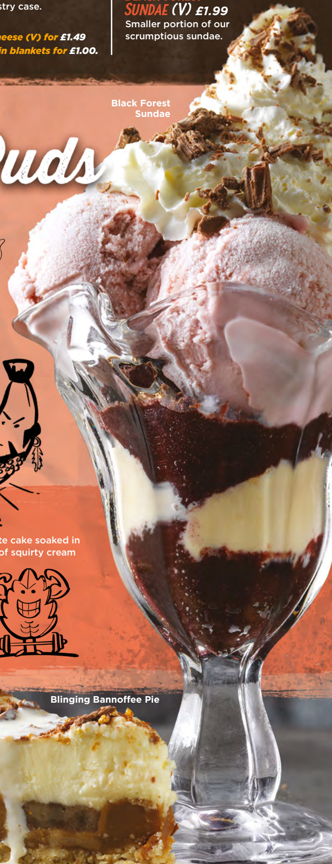
Blinging Bannoffee Pie