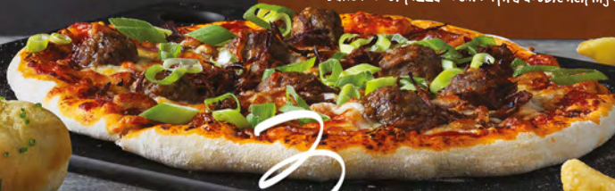
Great Balls of Smoke!