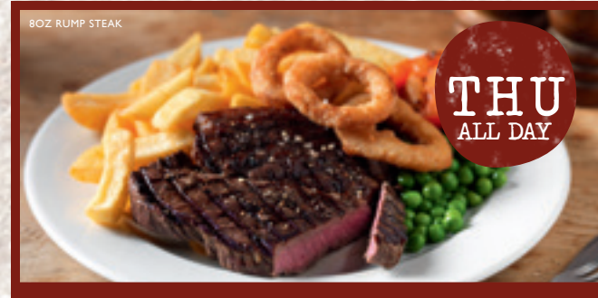
SELECTED STEAKS £6 CHOOSE FROM: BOZ SIRLOIN, BOZ RUMP OR GAMMON STEAK. UPGRADE TO 100Z RIB EYE OL