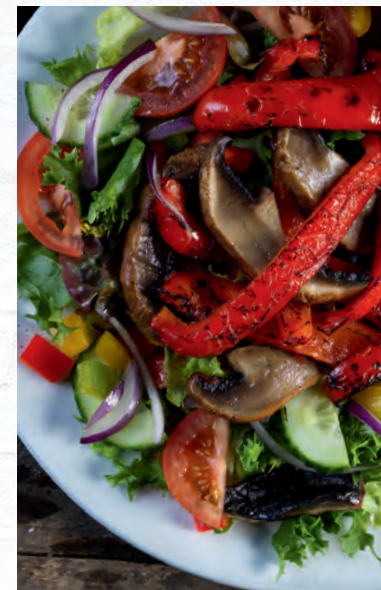
GRILLED RED PEPPER & MUSHROOM SALAD