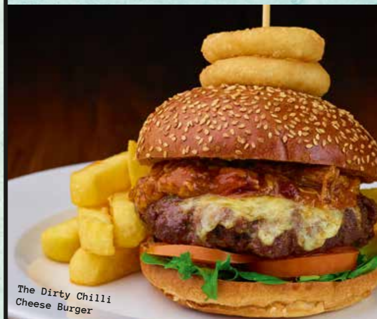
The Dirty Chilli Cheese Burger

UPGRADE YOUR CHIPS (V*) TO CURLY FRIES (V*) FOR £1