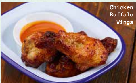
Chicken Buffalo Wings

Crispy Potato Skins^ £3.75 Filled with cheese and bacon and served with soured cream and a salad garnish. (V*) When served without the bacon.