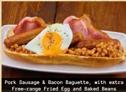
Pork Sausage & Bacon Baguette, with extra Free-range Fried Egg and Baked Beans

UNDER 700 Quorn™ Sausage & Free-range Fried Egg (V) £3.45